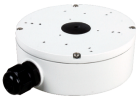
A22 JUNCTION BOX